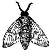
Figure 2: A sample black and white graphic (.eps format) that has been resized with the epsfig command.

single-column table, this wide table will “float” to a location deemed more desirable. Immediately following this sentence is the point at which Table 2 is included in the input file; again, it is instructive to compare the placement of the table here with the table in the printed dvi output of this document.